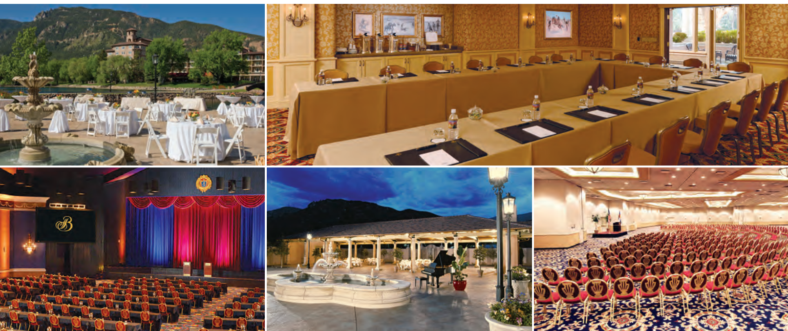
FROM LEFT, TOP TO BOTTOM Lakeside Terrace; Remington Room; International Center; Mountain View Terrace; Colorado Hall

Additional exhibit, breakout, and boardroom venues are throughout the property, giving The Broadmoor a total of 185,000 square feet of both indoor and outdoor adaptable, flexible function areas. With this opportunity, the status-quo is never satisfying. We are inspired by the challenge of making your grandest vision a reality.