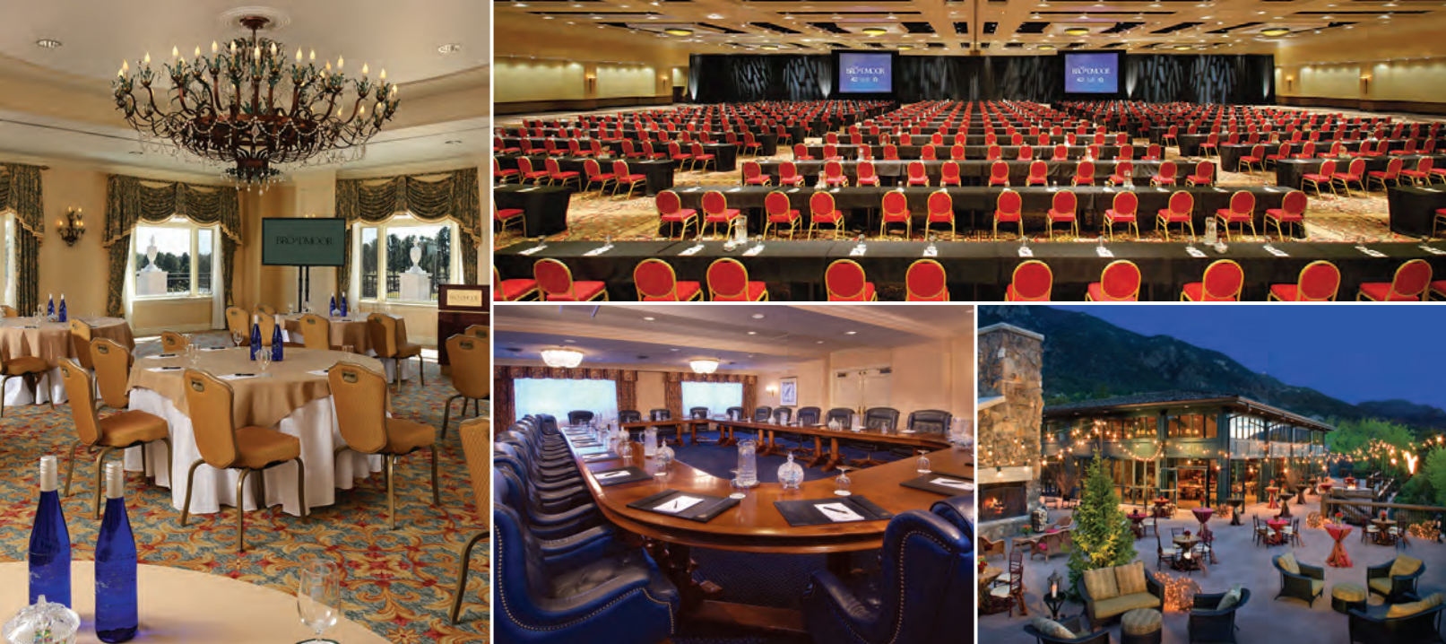
FROM LEFT, TOP TO BOTTOM Donald Ross Meeting Room; Broadmoor Hall; El Pomar; Cheyenne Lodge