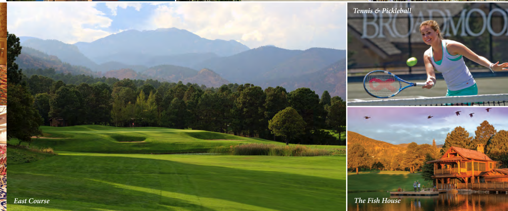
Tennis & Pickleball